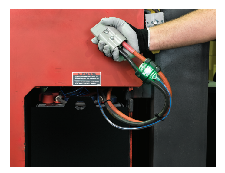
Blinking green LED indicates electrolyte level is good

The Blinky<sup>™</sup> family of monitors will help ensure your electrolyte levels are never too low or too high. They feature the industry's brightest LED, so they are much more visible. The new Smart Blinky Pro<sup>™</sup> introduces an audible dimension of electrolyte level notification. And, the installation forgiveness zone reduces the potential for damaging monitors during installation and provides a far wider voltage operating zone.