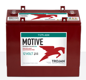
MOTIVE 12-VOLT AGM

C-Max Technology Proprietary Paste Premium Separator