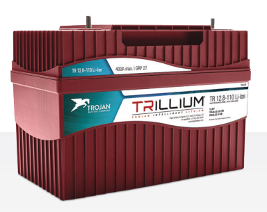
TR 12.8-110 LI-ION

Microprocessor Cell Balancing CAN Communications Battery Management System SOC Gauge